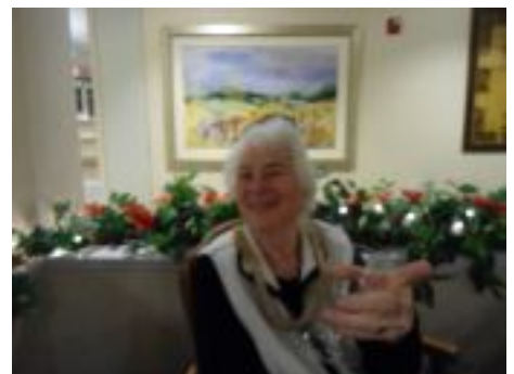
Toasting all to a fabulous and healthy New Year!